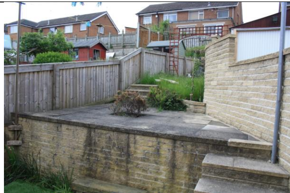
New wall & patio re-laid