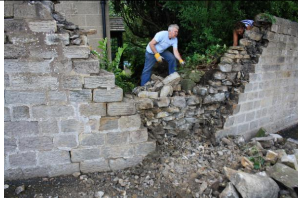
Collapse after storm. Lime mortared retaining wall in Conservation Area.